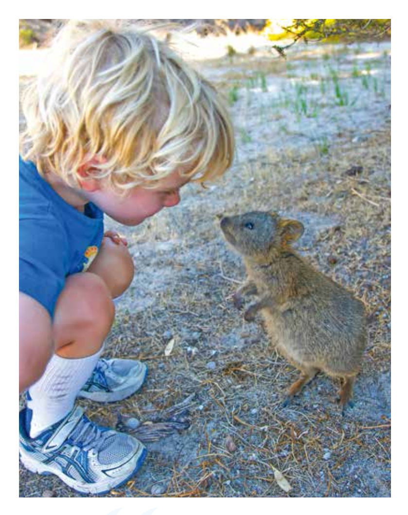
Rottnest is a wonderful place to let your kids run free

boys, some aged only eight, who were jailed for minor offences such as stealing food.